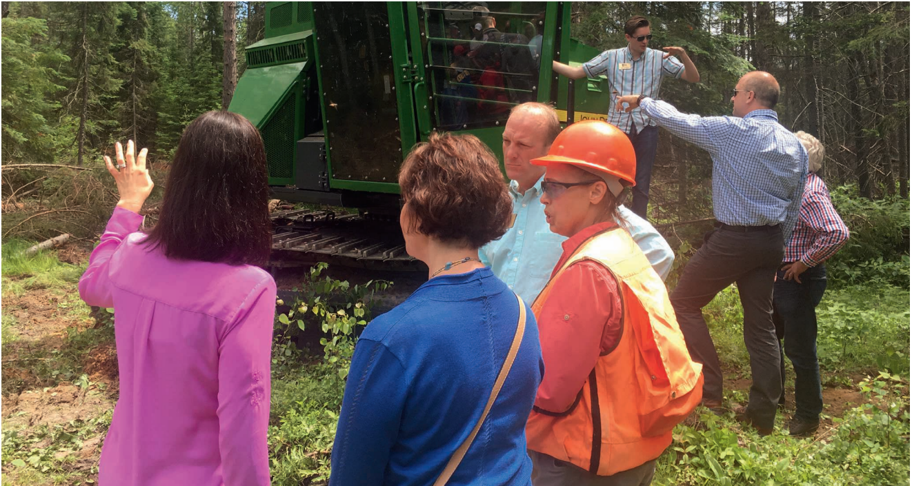
Leadership students take a field tour of a logging operation in northern Minnesota.